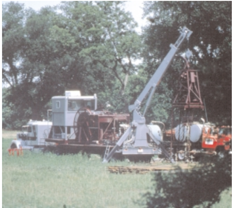
Hydra Rig's first Coiled Tubing Unit (CT-1) in operation in 1980.