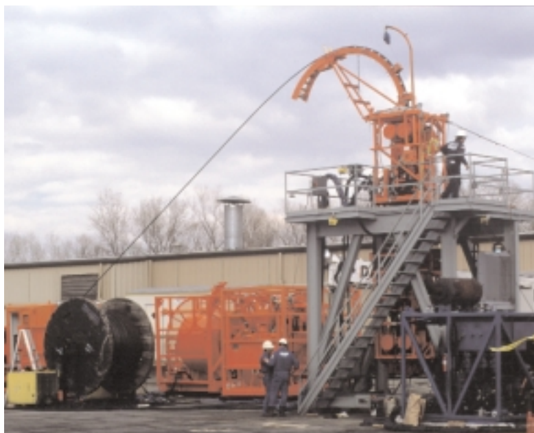
Hydra Rig HR-480 injector being tested to vary dynamic loading capability.