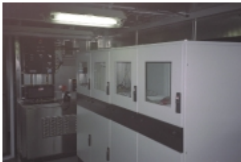
This Coiled Tubing Drilling Control Cabin gives operators a safe environment from which to operate various coiled tubing equipment, injectors, BOP's and strippers.

The second and third cabins are currently under construction and inquiries from other operators have highlighted the interests in the marketplace for this type of equipment, and a commitment by both the operators and oil companies to Coiled Tubing Drilling projects. ♦