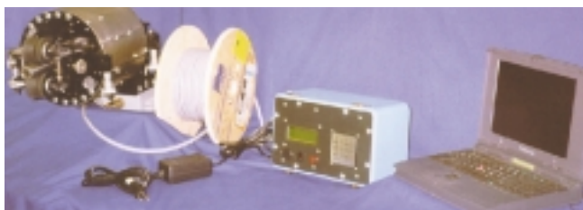
This Coiled Tubing Diameter Ovality Gauge is one of the state-of-the-art systems designed for the coiled tubing industry.

Failures that are not only costly and time consuming for everyone but also potentially dangerous.